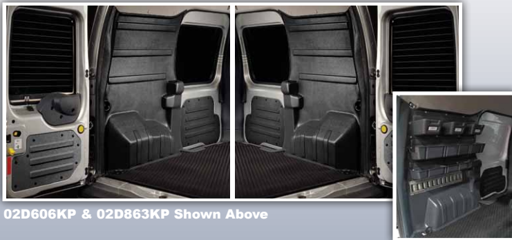
02D606KP & 02D863KP Shown Above