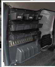
02C685KP Shown Above

Protect van from dents and scratches with durable ABS wall and door panels that fit tight against the walls. Wall insulation assists with temperature and noise control. EconoCargo® is fully compatible with all Masterack® Steel Racks & Bins, QuietFlex®, and Cargo Management Packages.