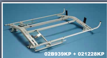
02B939KP + 021228KP

Easy-to-use clamping action secures ladders in place. Ladders are easily loaded and unloaded from the side of the van for safe, efficient operation. Zinc plated and powder coated for maximum outdoor protection.